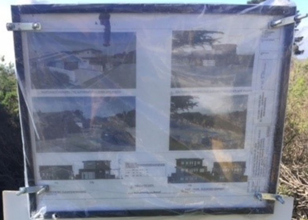
NOTHING TO BE BUILT AT THIS LOCATION