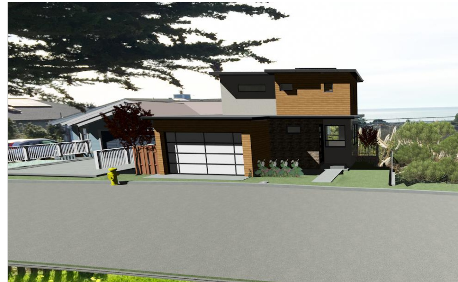
② SOUTHWEST PERSPECTIVE SUPERIMPOSED OVER SITE PHOTO