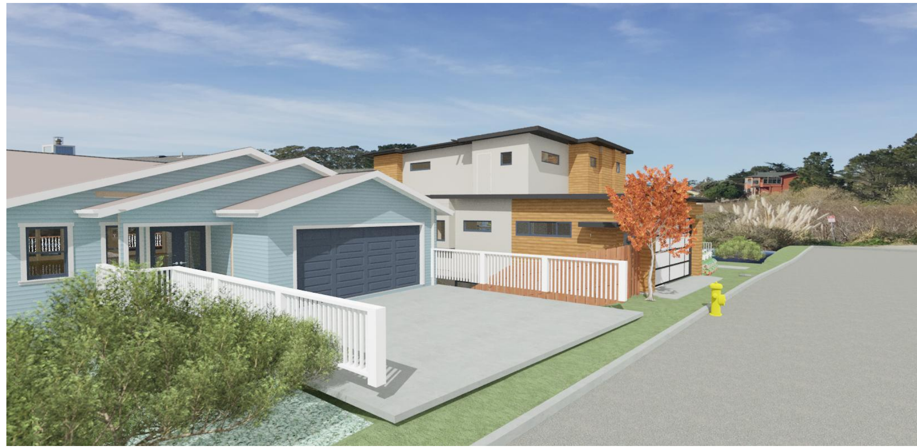
① NORTHWEST PERSPECTIVE SUPERIMPOSED OVER SITE PHOTO