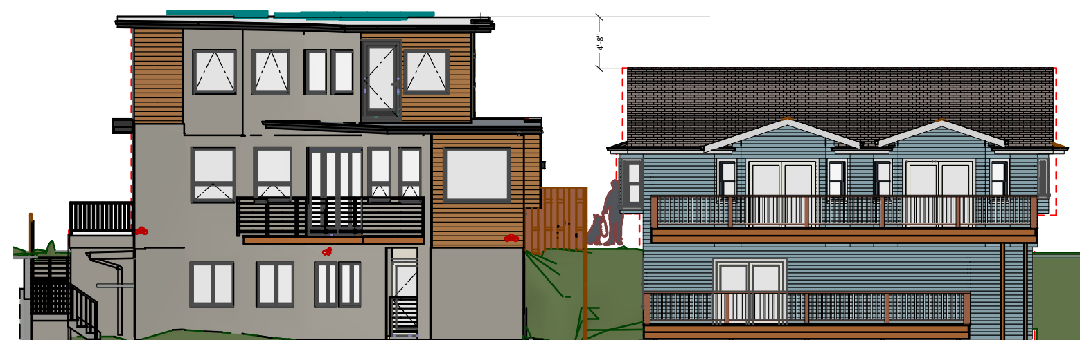
⑤ EAST - REAR, ELEVATION MASSING SCALE: 1/8" = 1'-0"